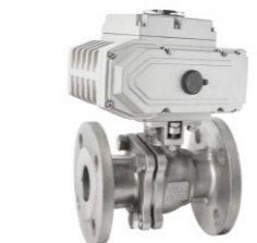
SCS13电动日标法兰球阀 SCS13 Electric JIS Flange Ball Valve