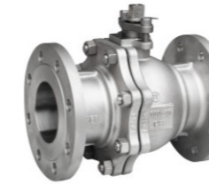
CF8国标法兰球阀 CF8 GB Flanged Ball Valve