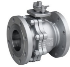
WCB美标法兰球阀 WCB API Flanged Ball Valve

DN15-DN300 ● A105 ● F304 ● F316 BS5351 MSS SP-118 /ANSI B16.11 JB/T1751 ANSI B16.5