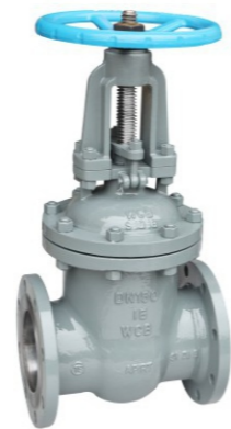
WCB国标法兰闸阀 WCB GB Flange Gate Valve