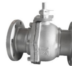
WCB日标法兰球阀 WCB JIS Flanged Ball Valve