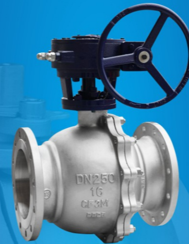
CF3M国标蜗轮法兰球阀 CF3M GB Worm Flange Ball Valve