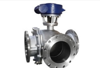
三通法兰球阀 Three way flanged ball valve