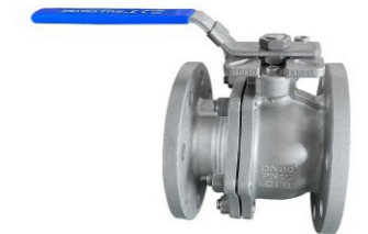
CF8德标法兰球阀 CF8 DIN Flanged Ball Valve