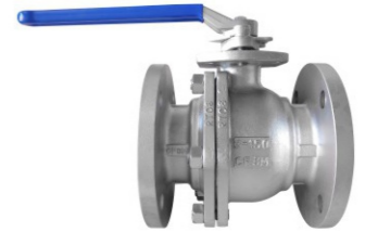
CF8M美标法兰球阀 CF8M API Flanged Ball Valve