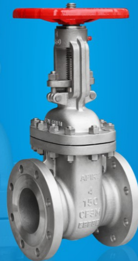
CF3M美标法兰闸阀 CF3M API Flange Gate Valve