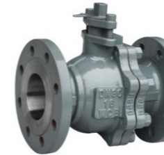
WCB国标法兰球阀 WCB GB Flanged Ball Valve