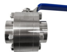
锻钢三片式承插焊球阀 Forged steel three piece socket welding ball valve