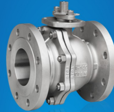
CF8M美标法兰球阀 CF8M API Flanged Ball Valve