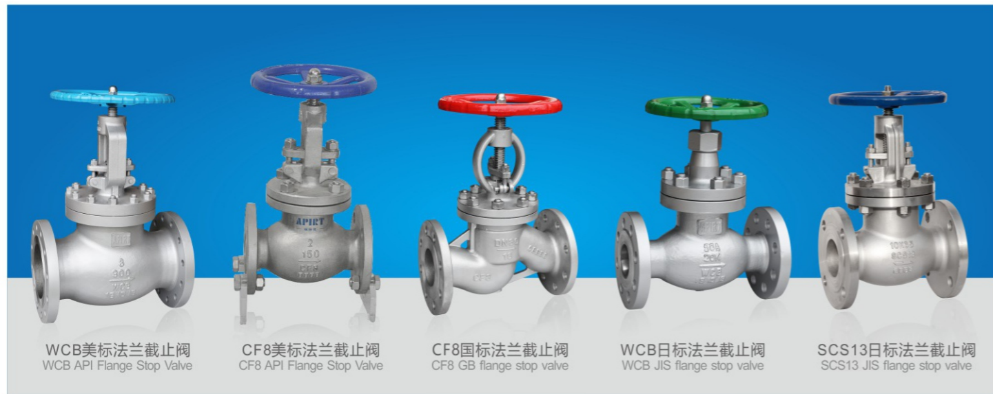
WCB美标法兰截止阀 WCB API Flange Stop Valve CF8美标法兰截止阀 CF8 API Flange Stop Valve CF8国标法兰截止阀 CF8 GB flange stop valve WCB日标法兰截止阀 WCB JIS flange stop valve SCS13日标法兰截止阀 SCS13 JIS flange stop valve