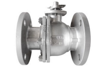
SCS13日标法兰球阀 SCS13 JIS flanged ball valve