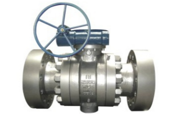
WCB高压三片式固定法兰球阀 WCB High Pressure Three piece Fixed Flange Ball Valve