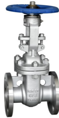
CF8日标法兰闸阀 CF8 JIS Flange Gate Valve