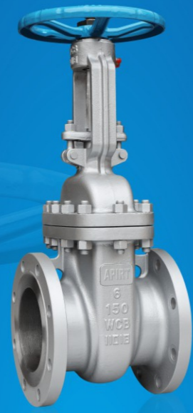
WCB美标法兰闸阀 WCB API Flange Gate Valve