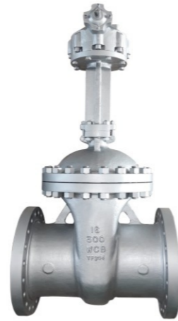
WCB美标伞齿轮法兰闸阀 WCB API Bevel Gear Flange Gate Valve