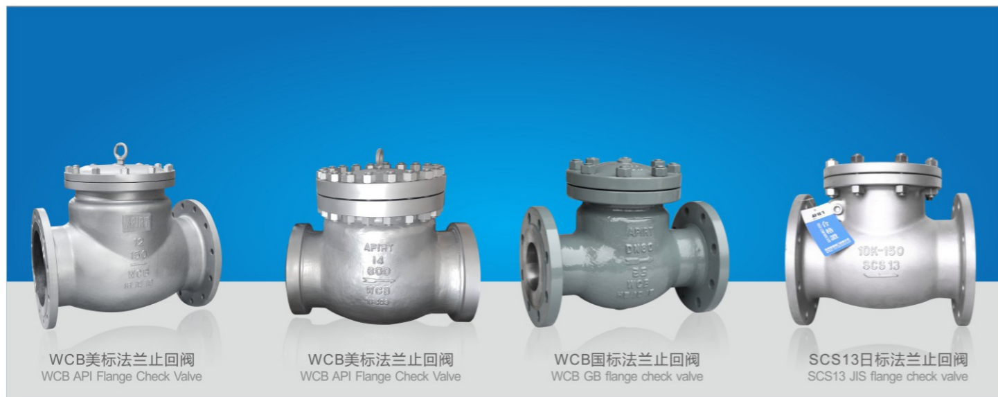
WCB美标法兰止回阀 WCB API Flange Check Valve WCB美标法兰止回阀 WCB API Flange Check Valve WCB国标法兰止回阀 WCB GB flange check valve SCS13日标法兰止回阀 SCS13 JIS flange check valve