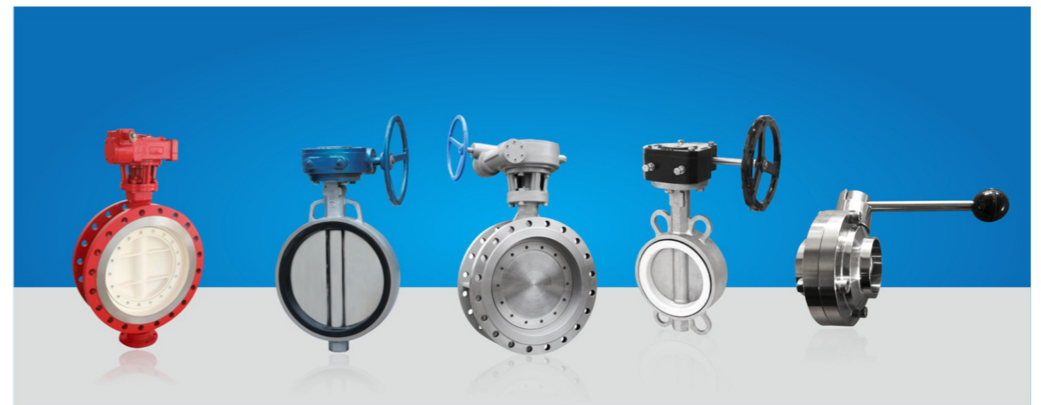
法兰蝶阀 2"-48" QT450 500 A216-WCB P1.6 150# GOST AWWAC504 API609 DIN3354 BS5155 对夹蝶阀 1/2"-8" QT450/CF8/CF8M 150# P1.6 10K AWWAC504 API609 DIN3354 BS5155 不锈钢蝶阀 DN50-DN1200 WCB/CF8/SUS304/1.4408 GB/T12238 GOST API609 美标/日标蝶阀 40A-300A SCPH2/SCS13/SUS304/SCS14 SUS316 10K-40K JIS JISB2002 JISB2003 API609 快装蝶阀 DN15-DN100 1.4408 SUS304 K5CrNiMo1712-2 BS5351 MSS SP-118 DIN3354 ANSI B16.5