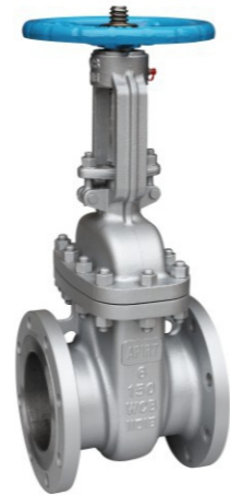
WCB美标法兰闸阀 WCB API Flange Gate Valve