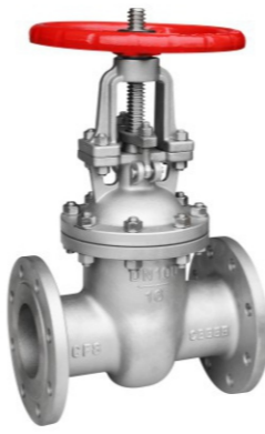
CF8国标法兰闸阀 CF8 National Standard Flange Gate Valve