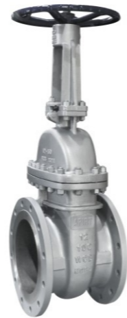
WCB美标法兰闸阀 WCB API Flange Gate Valve