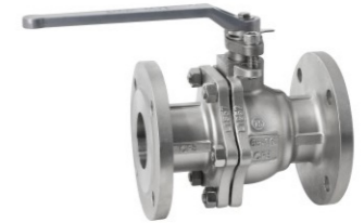
CF8国标硅溶胶法兰球阀 CF8 GB Silicone Sol Flange Ball Valve